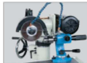
Grinding router bit: (Simple type) NEW