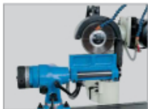
Grinding carbide knife