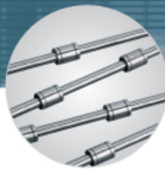
JF-180 work table with Linear motion slide ball bearing

Always better than ever, we develop new models while improve the existent ones. Get all good quality knife grinders just you need from our complete range and enjoy your sharpening!