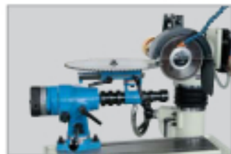
Grinding carbide saw: (Simple type) NEW