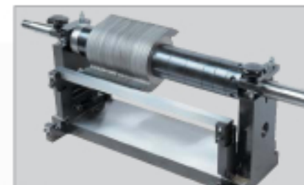
JF-400 Setting device with one arbor for finger jointer cutter