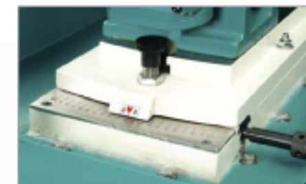
Rotation angle of worktable